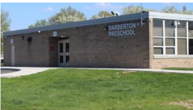
Barberton Preschool (3-5 Years Old) 633 Brady Avenue 330-780-3208