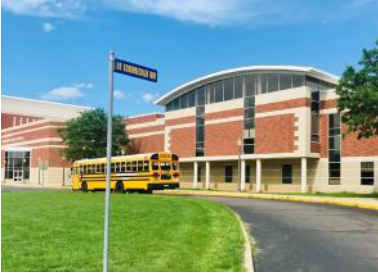
Barberton High School (9th - 12th Grade) 555 Barber Road 330-753-1084