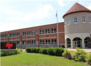
Barberton Intermediate School (3rd - 5th Grade) 292 Robinson Avenue 330-745-5492