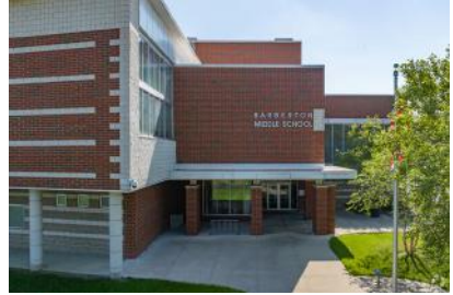
Barberton Middle School (6th - 8th Grade) 477 4th Street NW 330-745-9950